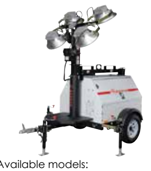
MLT 4060MV, MLT 4060KV MLT 4080KV, MLT 4150MV. MLT 4200IV, MLT 4250IV