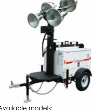
Available models: MLT 3060MV, MLT 3060KV MLT 3080KV